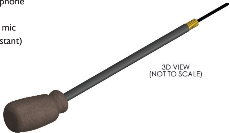
3D VIEW (NOT TO SCALE)